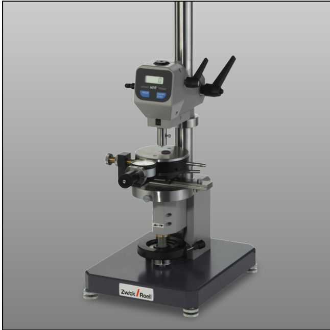
ZwickRoell 3103 IRHD micro compact Hardness Tester